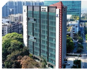
WTC Annexe 0.1 Mn sq.ft