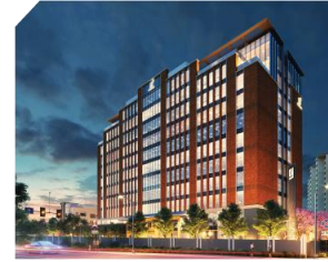
Bridage Triumph 0.2 Mn sq.ft