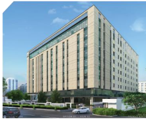
Brigade Southfield 0.35 Mn sq.ft