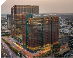
World Trade Centre 2.0 Mn sq.ft