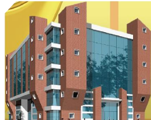
Brigade Point 0.03 Mn sq.ft