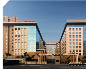
World Trade Centre 0.7 Mn sq.ft