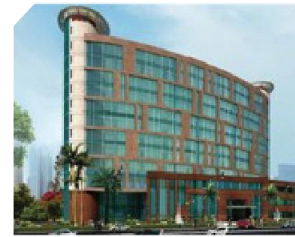
Brigade Bhuwalka Icon 0.2 Mn sq.ft