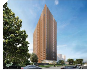
Bridage Deccan Heights 0.4 Mn sq.ft