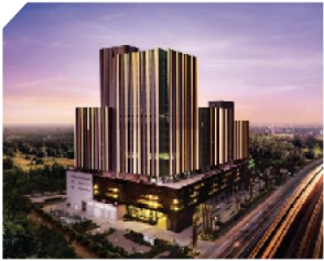
Brigade Signature Tower 0.6 Mn sq.ft