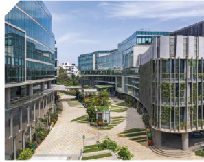
Brigade Tech Gardens 3.0 Mn sq.ft