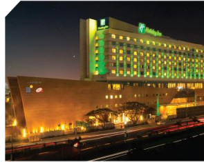
Holiday Inn - Office space 0.01 Mn sq.ft