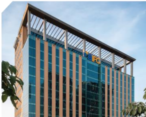
BIFC, GIFT City 0.3 Mn sq.ft