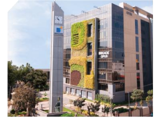
Bridage Opus 0.35 Mn sq.ft