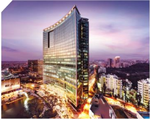
World Trade Centre 1.1 Mn sq.ft