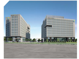
Brigade Senate 0.54 Mn sq.ft