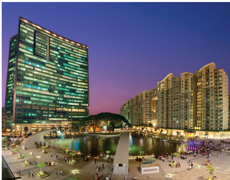
Actual shot of Brigade Gateway, Bengaluru

Brigade Group is among the few developers who also enjoy a reputation of developing Grade A commercial properties. Some of the Group's commercial development includes, the World Trade Center Bengaluru & Kochi, Software and IT parks, SEZs and stand-alone offices having reputed international clients operating from them.